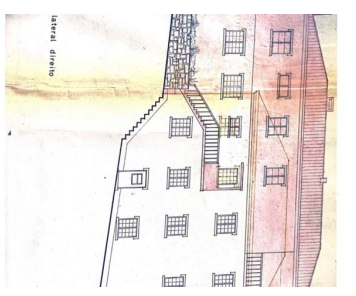
555 Area (m²)